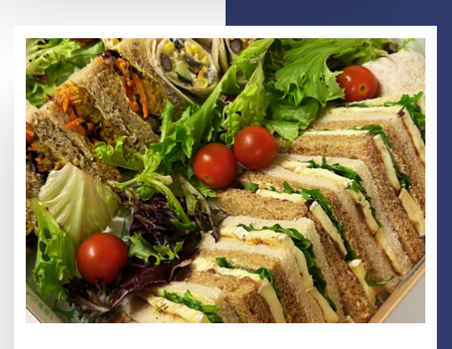
BEST IN SHOW